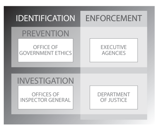
Figure 1: Institutional Integrity

The Ethics in Government Act charges OGE with leading the effort to prevent conflicts of interest in the executive branch. OGE undertakes this important prevention mission as part of a framework comprising